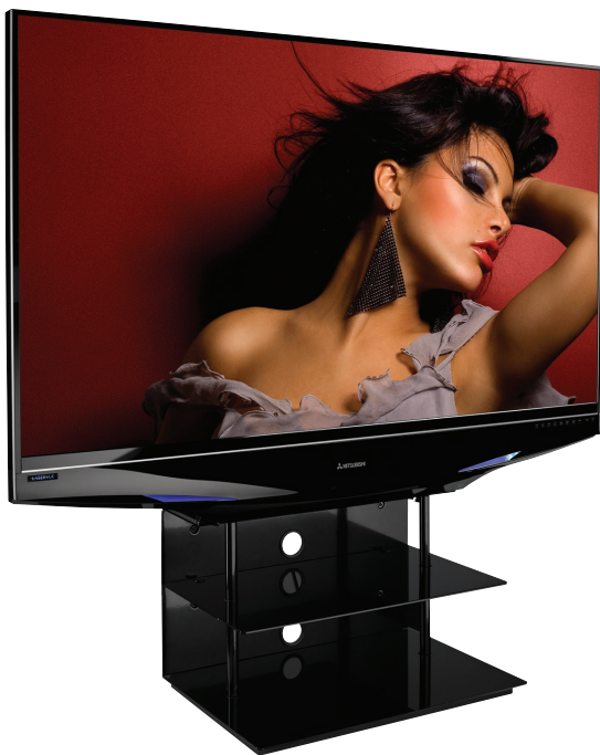
L65-A90 model shown on LFB-65 matching base