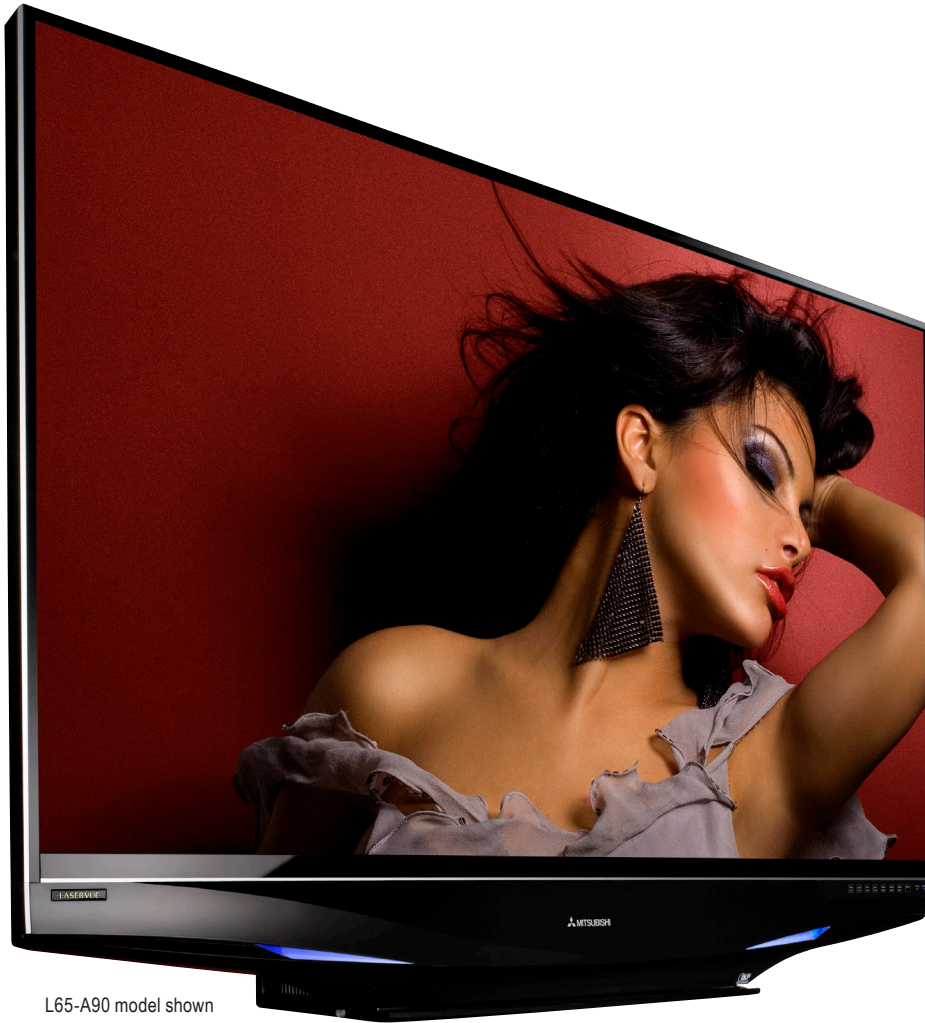
L65-A90 model shown